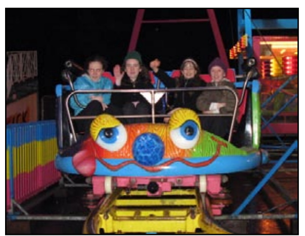
Some of the girls enjoying the Wild Mouse roller coaster

on their now annual trips to Funderland in early January. This year all were faced with men, half a dozen of the girls,