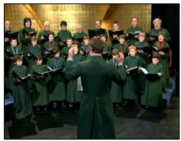
The choir on national television.

and the result was entirely convincing. The preacher was the Reverend Canon Albert