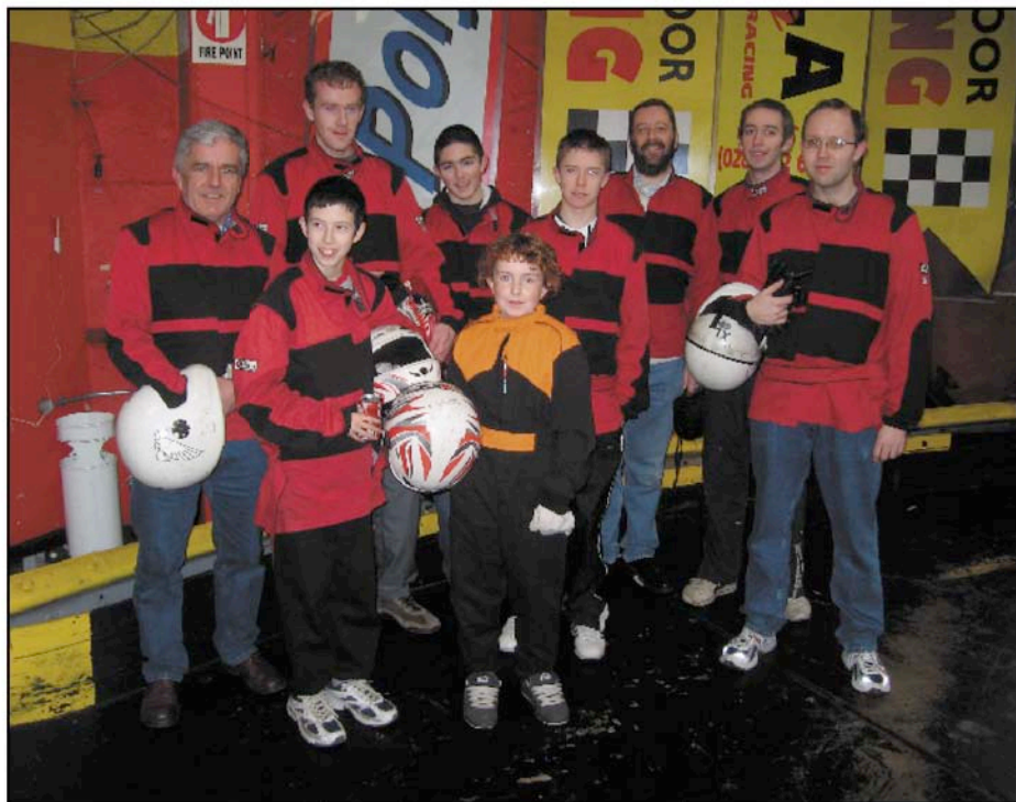
The entire group, exhausted...

was driving a smaller kart than the rest of us yet still managed an impressive time.