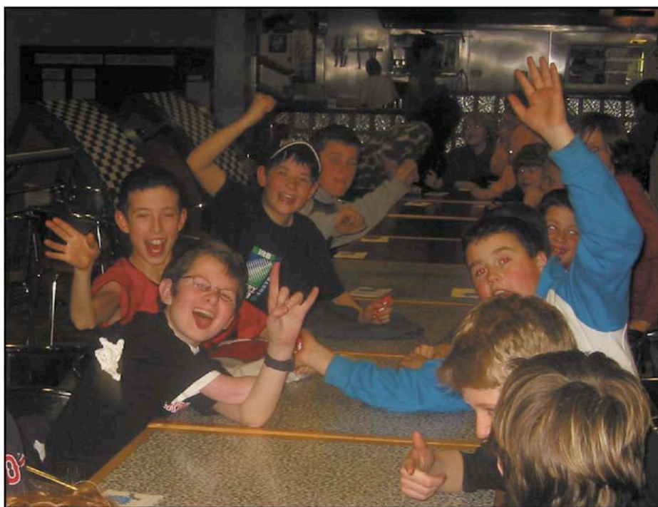
Organised Chaos